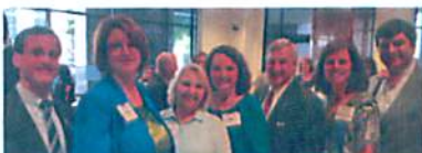
"leaders with our Leader—Mayor Todd Strange"